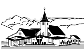
Edison Lutheran Church