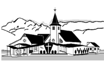
Edison Lutheran Church