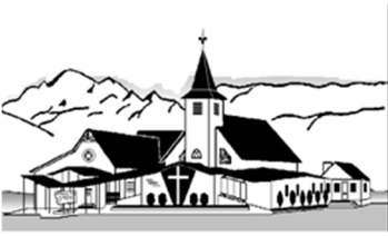
Edison Lutheran Church